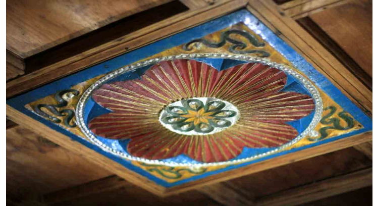
Code Name : MW_02