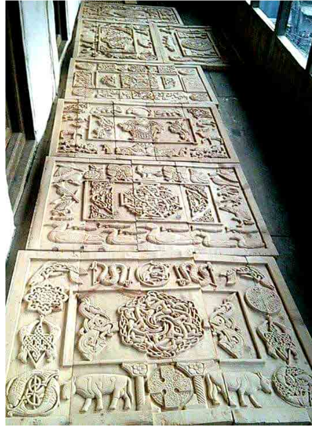
Code Name : DW_06