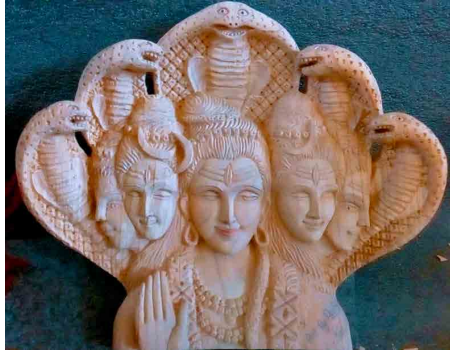
Code Name : PM_06