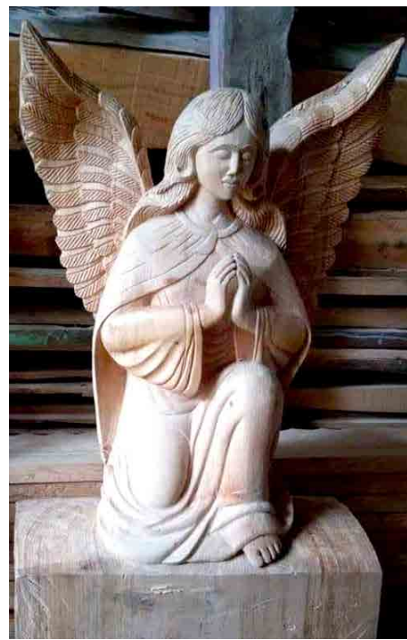
Code Name : PM_07