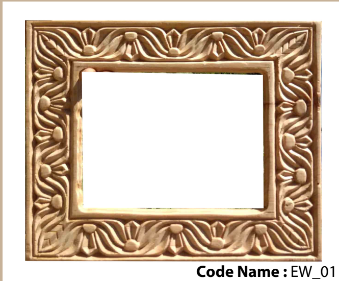
Code Name : EW_01