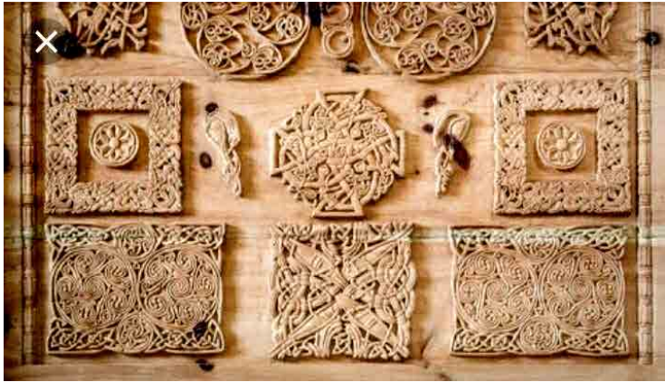
Code Name : DW_01