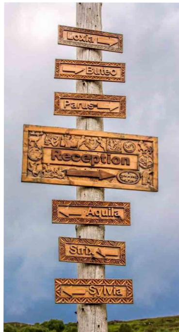
Code Name : MW_09