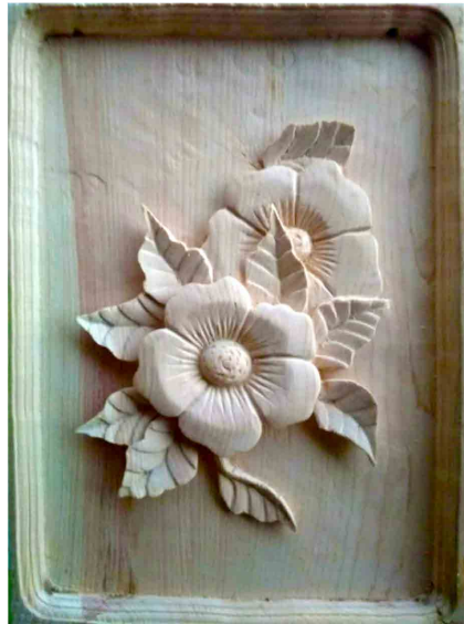
Code Name : MW_03