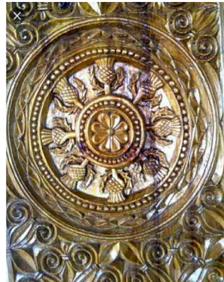
Code Name : MW_05