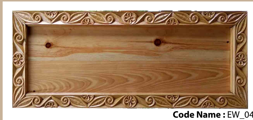
Code Name : EW_04