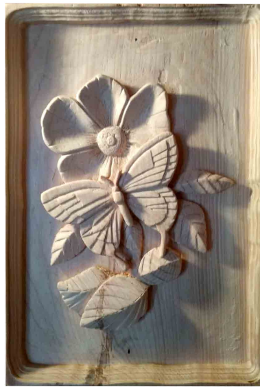
Code Name : MW_04