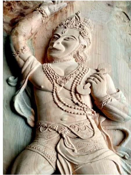
Code Name : PM_04