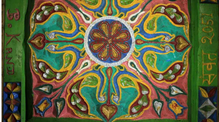
Code Name : MW_01