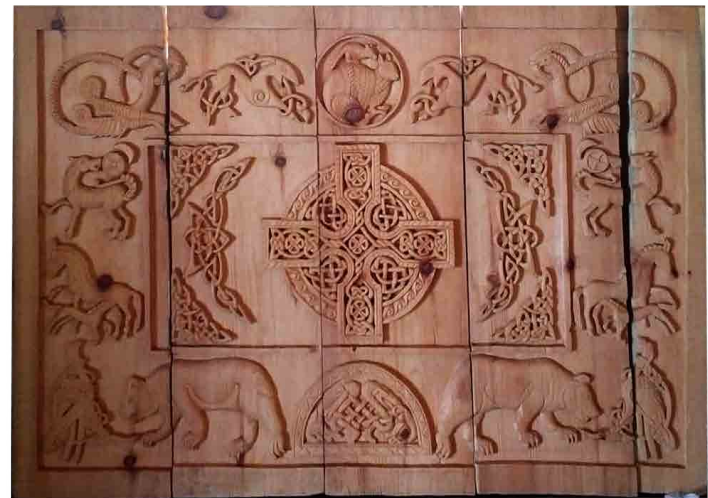
Code Name : DW_04