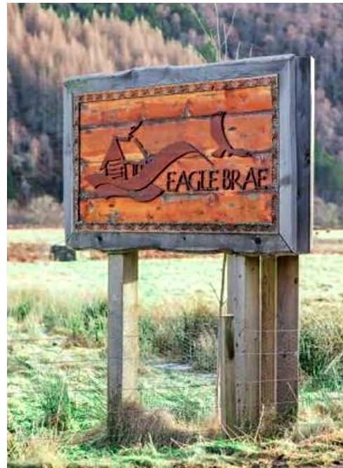
Code Name : MW_10