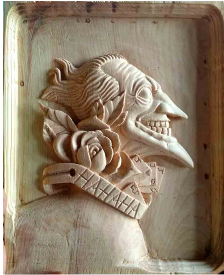
Code Name : PM_01