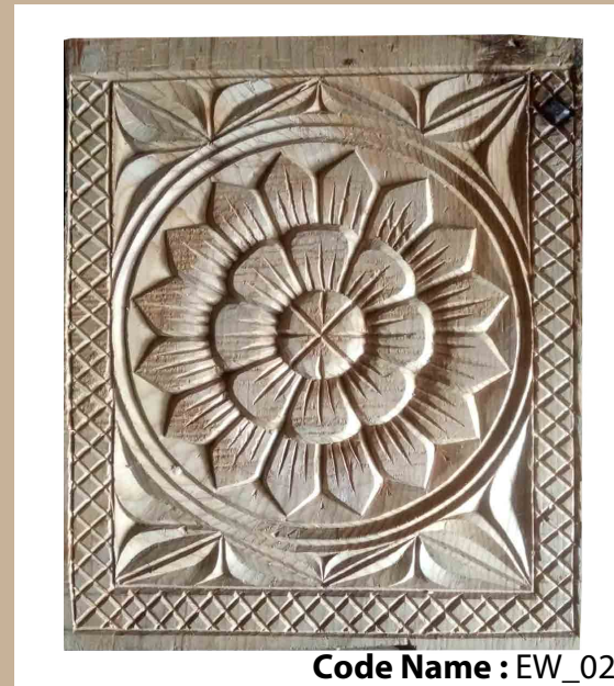
Code Name : EW_02