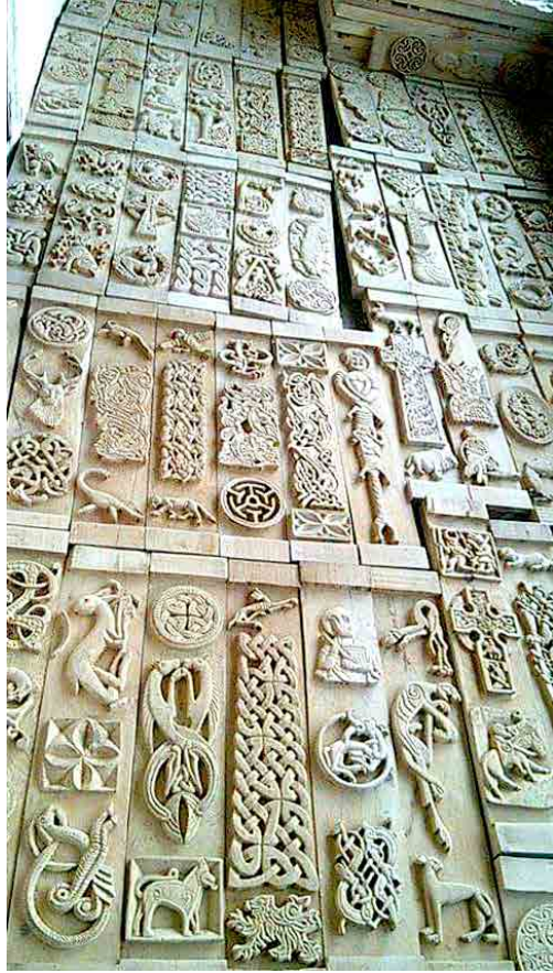
Code Name : DW_05