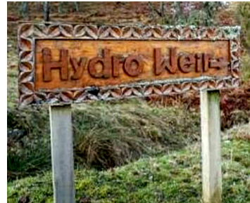
Code Name : MW_07