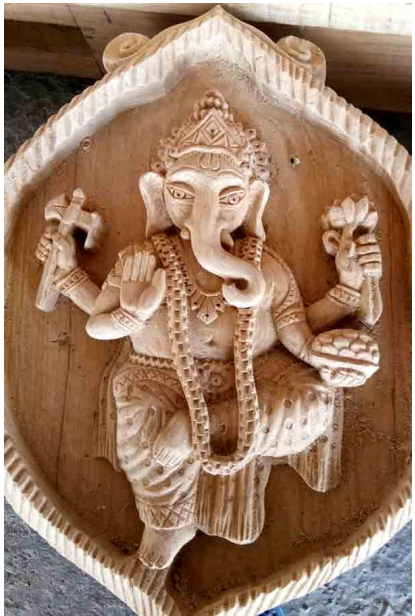
Code Name : PM_05