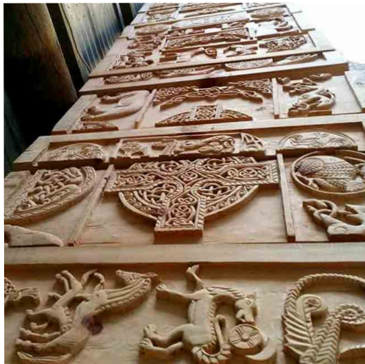
Code Name : DW_03