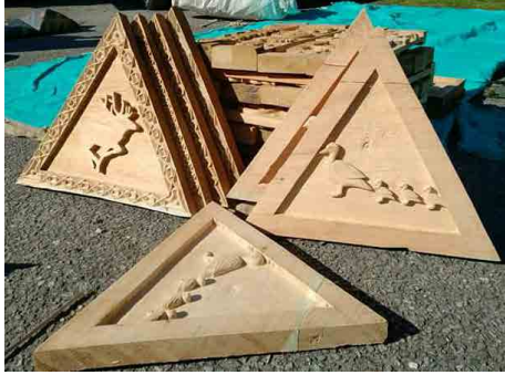
Code Name : MW_06