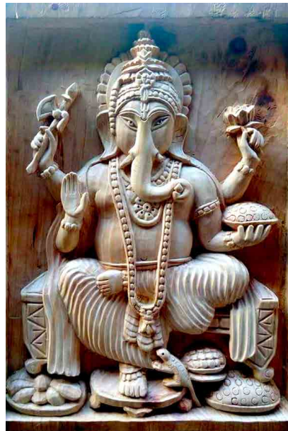
Code Name : PM_03