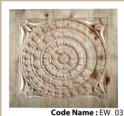
Code Name : EW_03