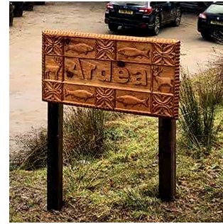
Code Name : MW_08