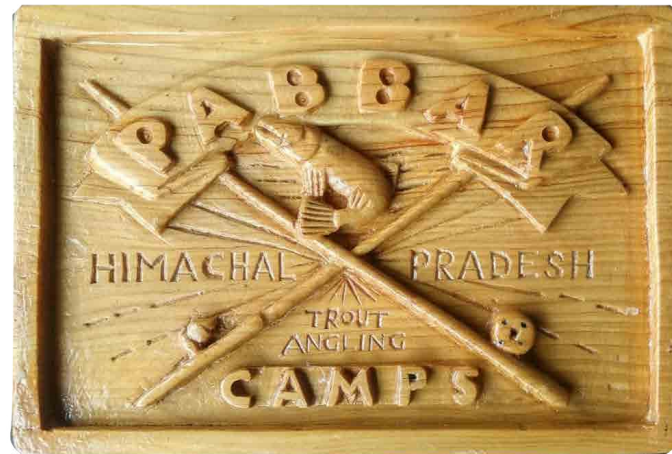
Code Name : EW_07