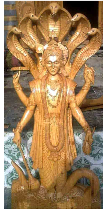
Code Name : PM_08