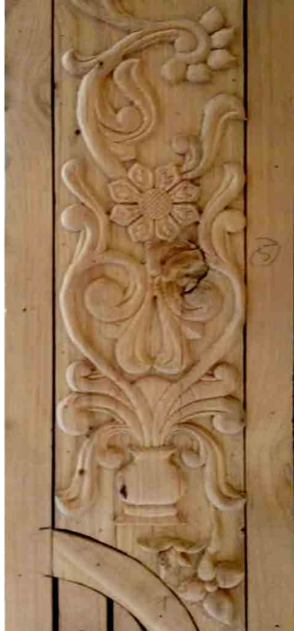
Code Name : EW_05