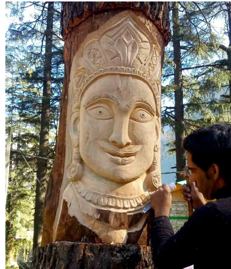
Code Name : PM_02